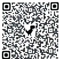
Coordinator Physical Education & Sports

All HODs/Directors/Coordinators/Principals of various Departments/Campuses/Centers/Colleges are hereby informed to depute interested bonafide student/players who participated in Inter College Badminton Tournament (Women) 2025, for participation in the trials along with Eligibility form and required documents. The eligibility form can be downloaded via the QR code provided below.